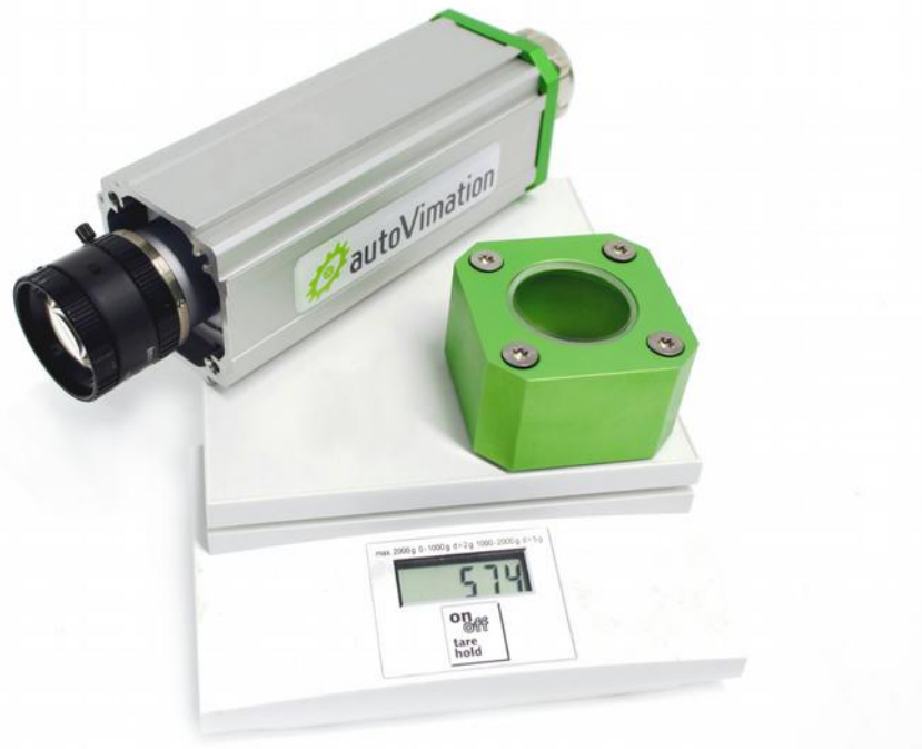
IP66 Protection for compact cameras with 29 x 29mm or 30 x 30mm cross section