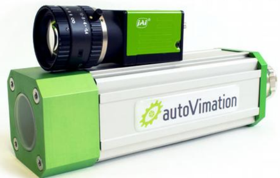
The Colibri enclosure – only little larger than a compact camera!