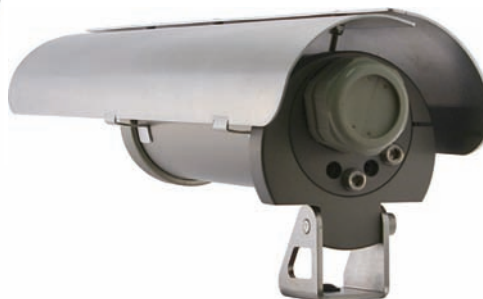
Heat / Sun Shields